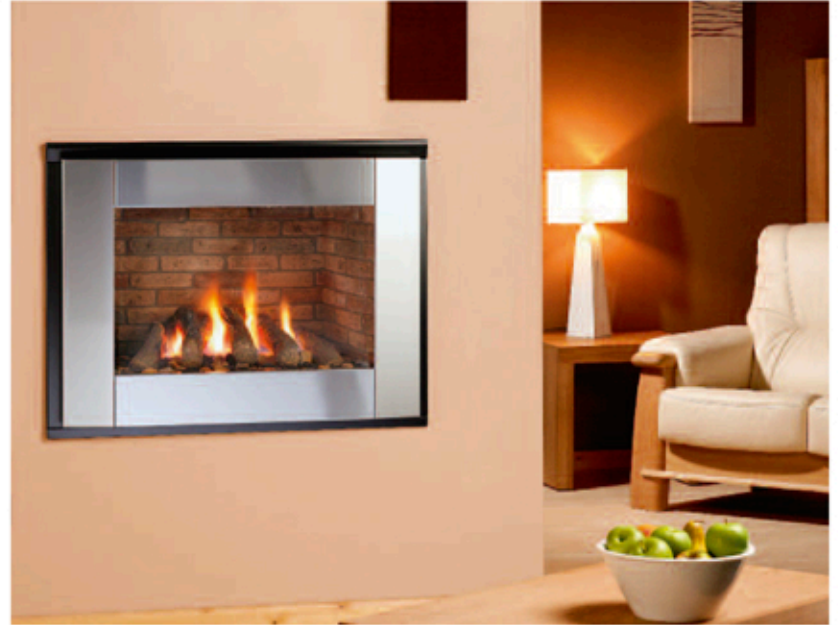
Synergy Perspective Steel Balanced Flue with Lacquered Brushed Stainless Door, Brick lining and Dark Log fuel effect.