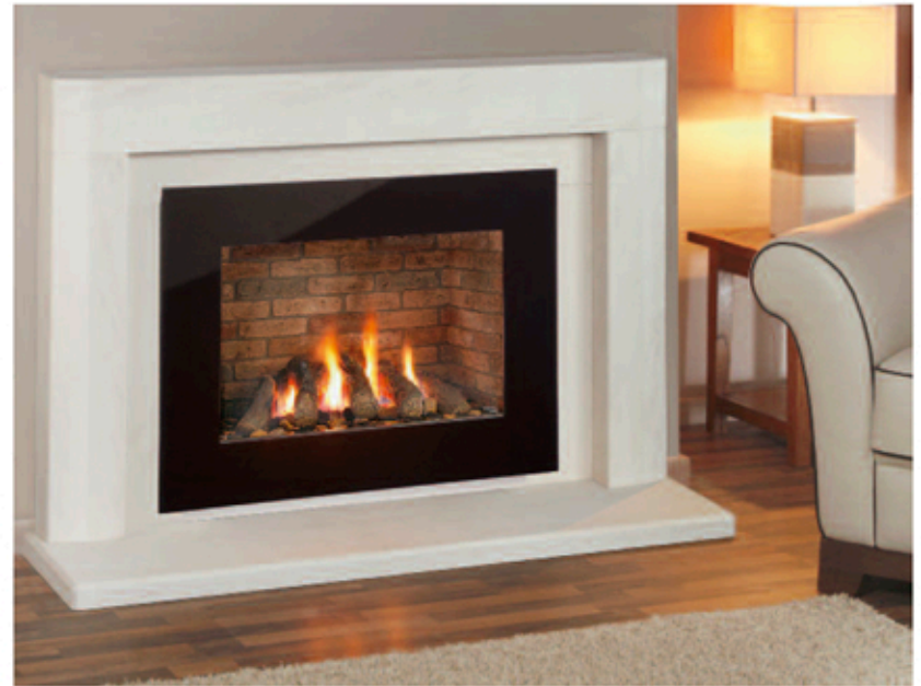
Synergy Perspective Glass Balanced Flue with Brick lining and Dark Log fuel effect shown in Nu-Flame's Limestone Synergy Fireplace.