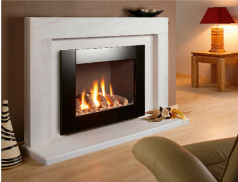
Synergy Perspective Steel Balanced Flue with Satin Black Door, Plain Black lining and Dark Log fuel effect shown in Nu-Flame's Limestone Synergy Fireplace.

The Synergy Perspective Steel Balanced Flue is a highly efficient and stylish fire that will enhance any home. Choose from Lacquered Brushed Stainless or four other gorgeous colours, applied using the latest techniques resulting in beautiful finishes that are both practical and durable.