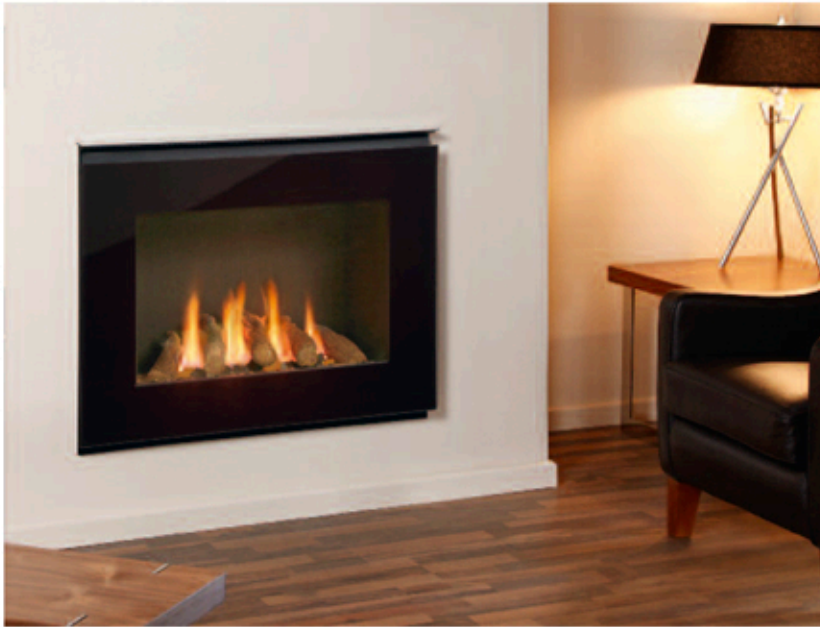
Synergy Perspective Glass Balanced Flue with Black Outer Frame, Reeded Black lining and Dark Log fuel effect.

The Synergy Perspective Glass Balanced Flue can be installed as a Hole in the Wall feature, or within a fireplace. The black all glass door is complemented by a choice of interior linings and options on the log effect.